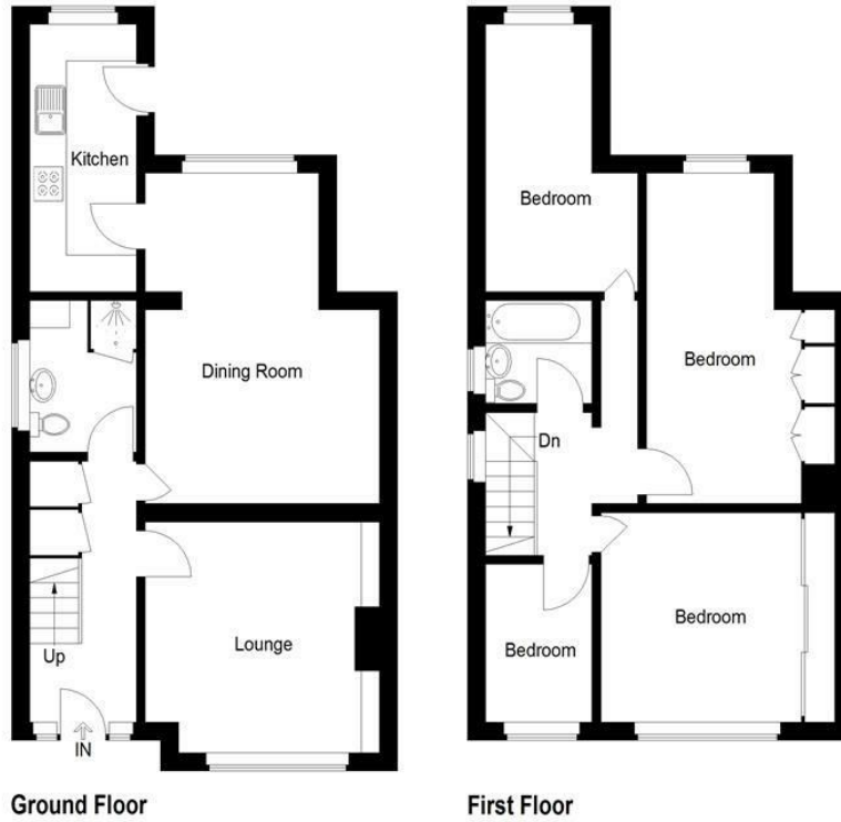
Illustration for identification purposes only, measurements are approximate, not to scale. floorplansUsketch.com © (ID1260139)

Approximate Gross Internal Area = 110.1 sq m / 1185 sq ft